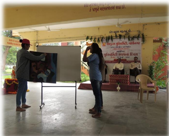
4. Department of Psychology student has done parade on 15 th August Independence day, 2018