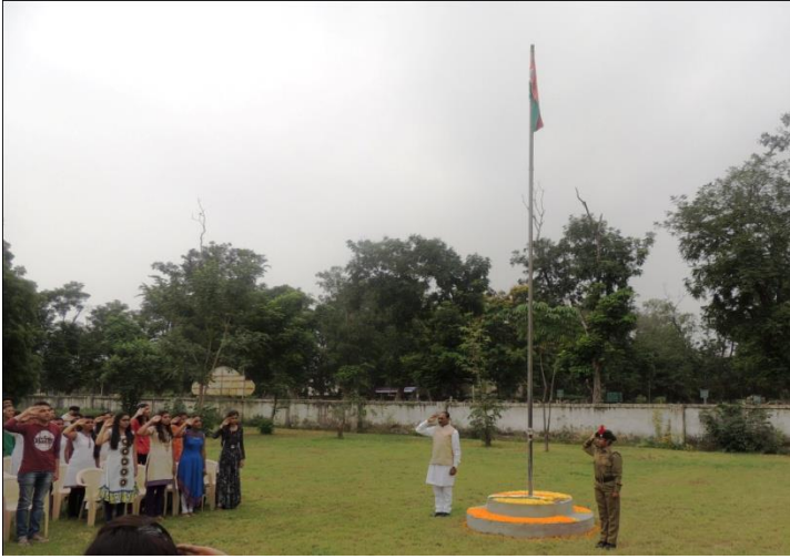
5. Department has celebrated teacher's Day on 05/09/2018.