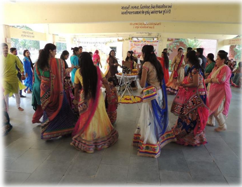
8. Department of Psychology student has done parade on 26 th January, Republic Day, 2019.