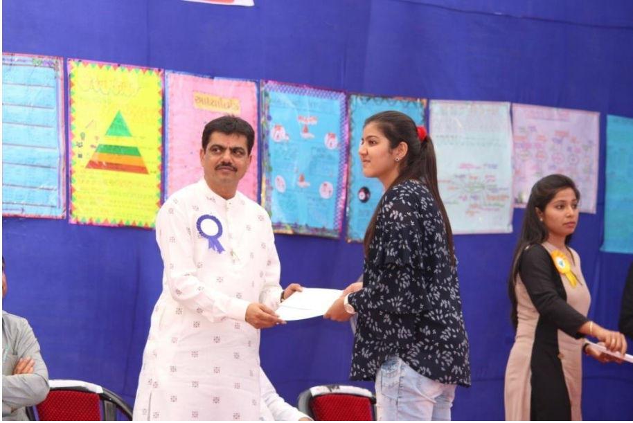
11. Department of Psychology student has celebrated Farewell of 2017's M.A. Batch.